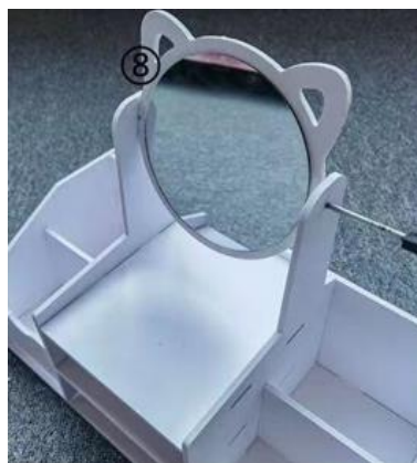
8. Instaliraj 8