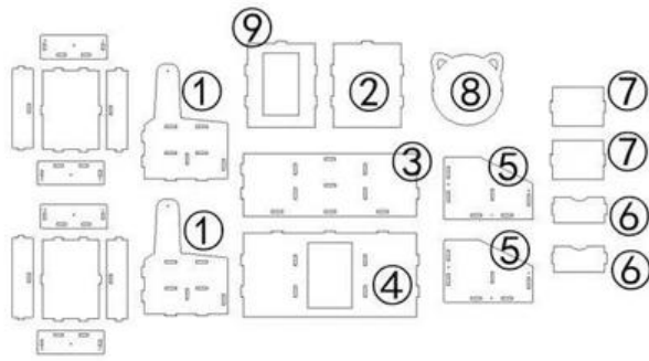
1. Instalirajte ladica