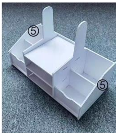
7. Instaliraj 5