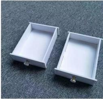
3. Instaliraj 1